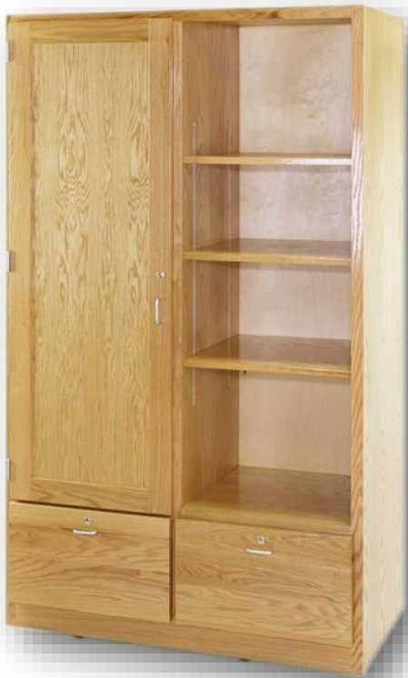
Tall Storage Cabinets Many Sizes and Options Wardrobe is shown - call for quote