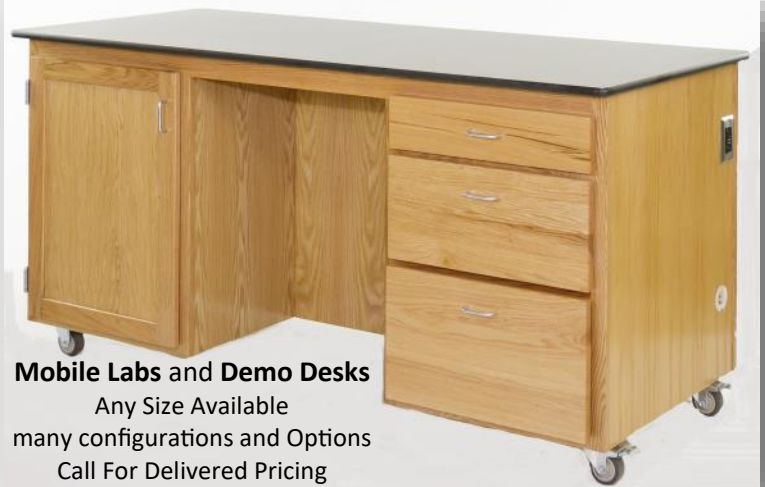
Mobile Labs and Demo Desks Any Size Available many configurations and Options Call For Delivered Pricing