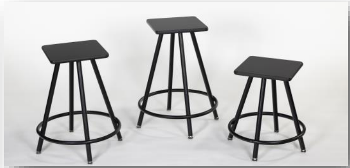
Stools - 18" - $145 22" - $157 24" - $168 14 ga 1" tubular legs, 11 ga foot ring, 12" square phenolic seat, steel glides