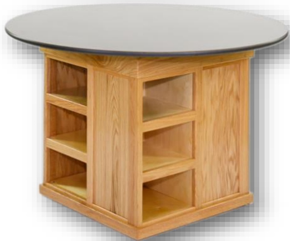
K8 Activity Centers - K8-48R30-SPR6-BLK - $1506 Available in heights from 26-36" 48" Round or Square top - Tote trays $12 ea